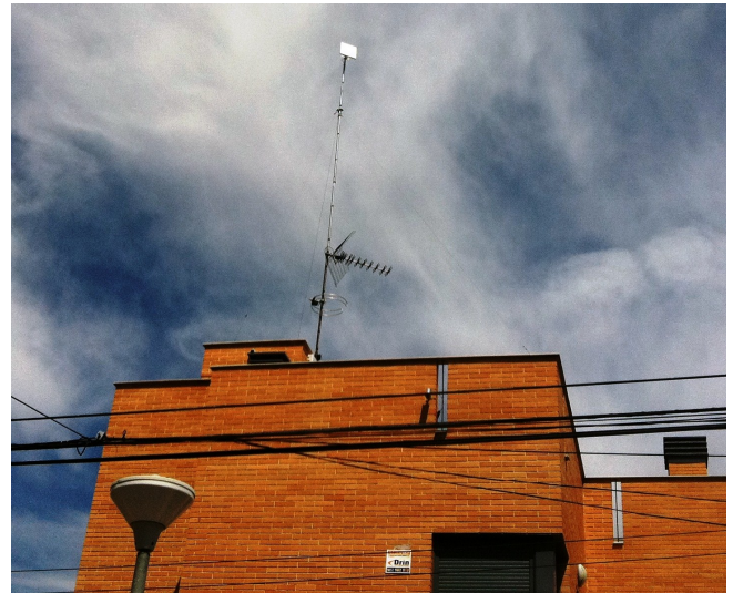
Data Center- Fibre-optic connection

Cost savings: Equipment costs paid off in less than 1 year. ACE Business Group has also saved up to 50 % on communication expenses compared to the wire option used so far.